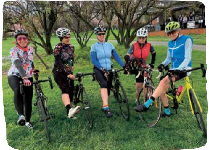
Some of our Champions riding to help support vulnerable children.

Thank you for putting your feet to the pedals and powering towards change. We look forward to welcoming you back once more in 2022 when the saddle soreness has subsided.