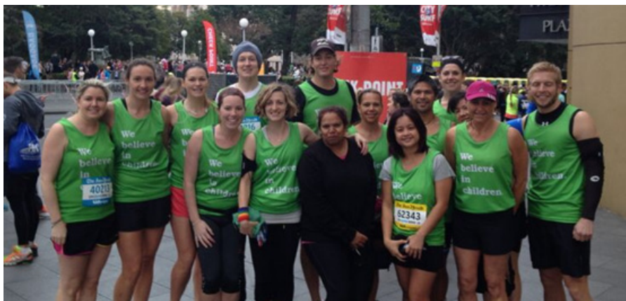
The Yurungai team before the big race

On Sunday 10th August, Barnardos case workers from the Yurungai Child and Family Service, along with other members of staff and their friends ran the Sydney City2Surf to raise funds for Barnardos. They initially only pledged to raise $100 each but completely smashed that target with a fantastic team total of $5,573.