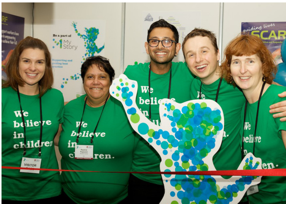
The MyStory team at the official launch

MyStory is the next chapter in Barnardos' ongoing investment in the future of all Australian children and has only been made possible thanks to the generous support of our donors. Thank you. If you would like to find out more information about MyStory, please visit my-story.org.au