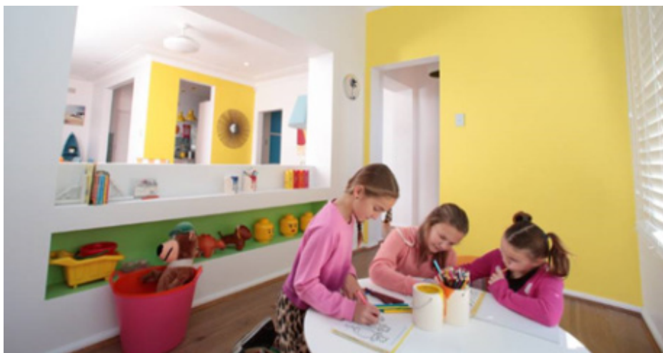
Children enjoying the newly renovated house